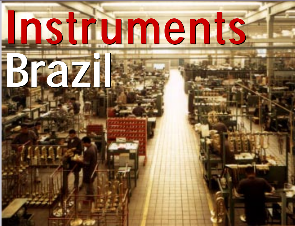
Complete wind instrument production line occupying 75,000 square feet

Almost one century old, Weril knew how to take advantage of the tradition acquired by its founder, Austrian Pedro Weingrill. At the same time it dared in terms of technology and also kept a team of experienced professionals. As a result, its high-quality instruments also started to gain space in other countries with the advent of globalization