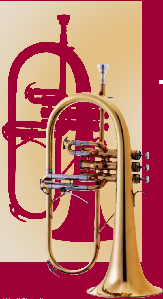
Weril Flugelhorn: an example of international quality instrument

Reference – pages 3 to 5: Music Trades Magazine, February 2002