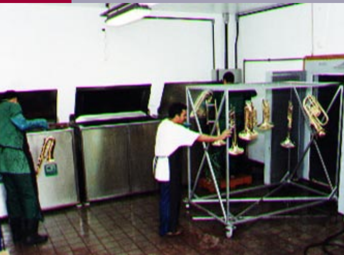
Ultrasound water bath