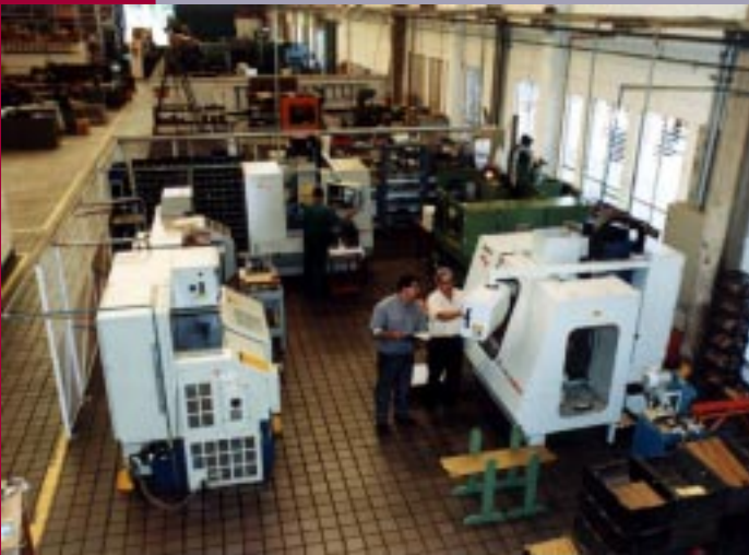
Modern CNC system: production of plastic bodies for clarinets and brass pistons and molding of small components

Brazil's lower labor and operating costs, combined with the company's tradition and expertise provide Weril products with a very competitive price on the US market. However, being located far from a promising market poses some difficulties. The company is managing to overcome the challenge by forming several international partnerships, such as with DEG Music Products.